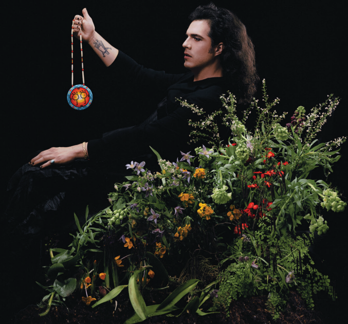
Photo of Jeremy Dutcher