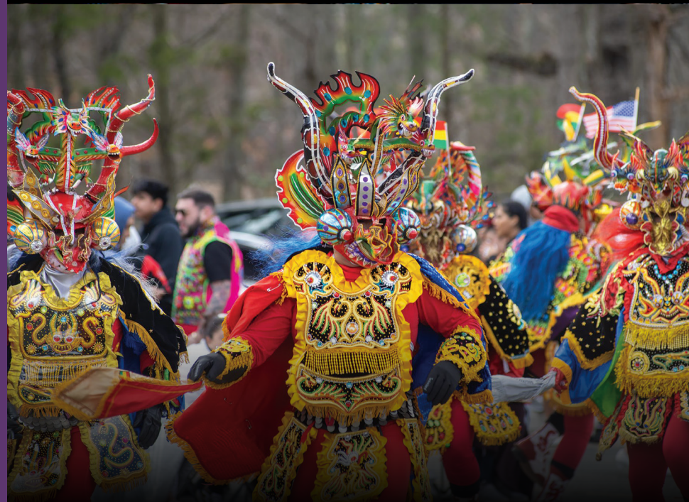
Members of Northern Virginia's Fundacion Socio Cultural Diablada Boliviana perform the Diablada dance in elaborate costumes.