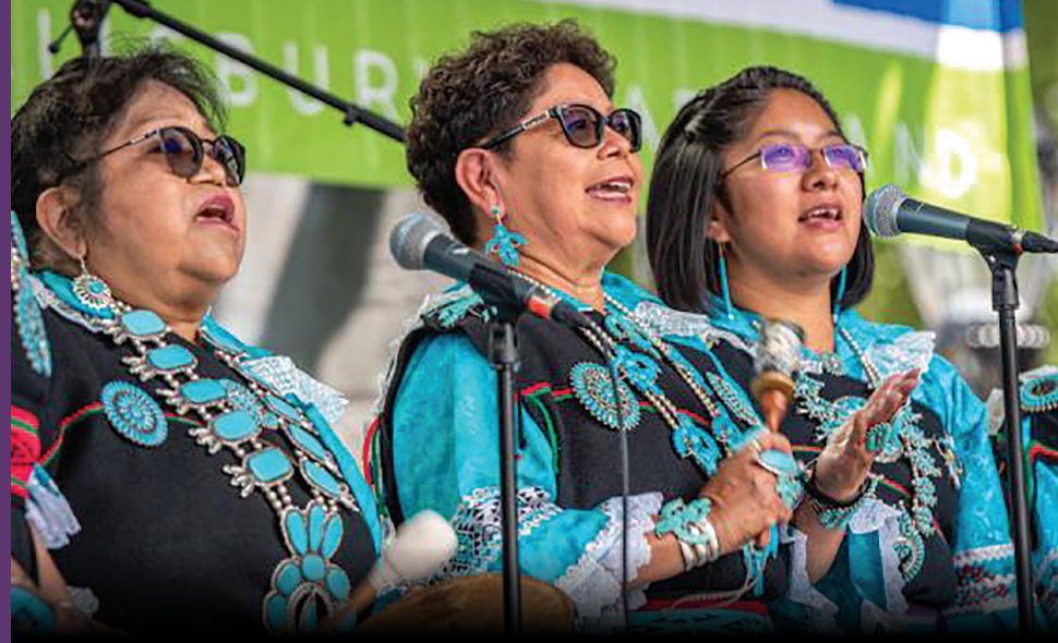
The Zuni Olli Maidens.